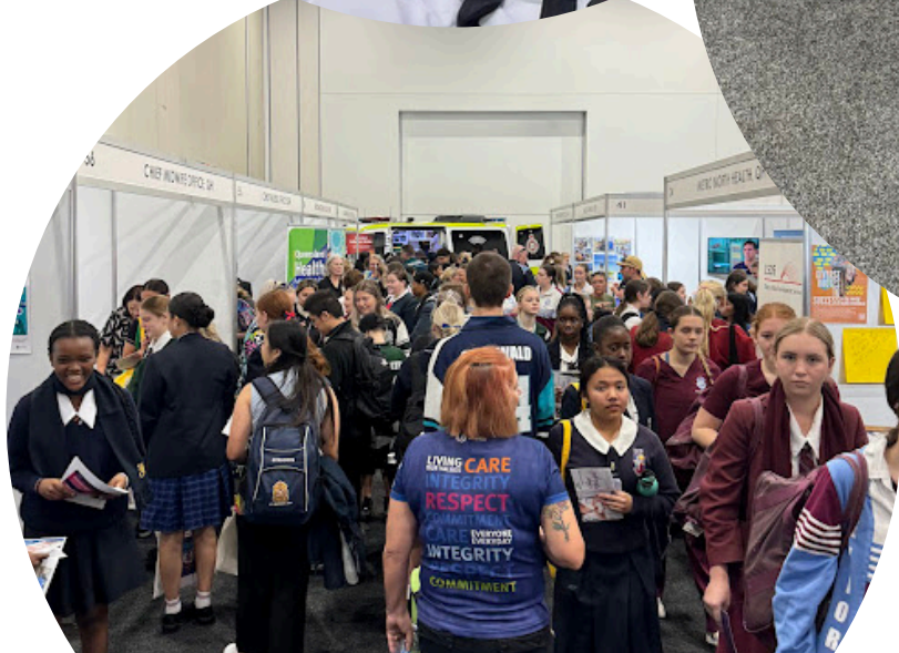
Photos of #GOHealth 2024 Royal International Convention Centre Brisbane